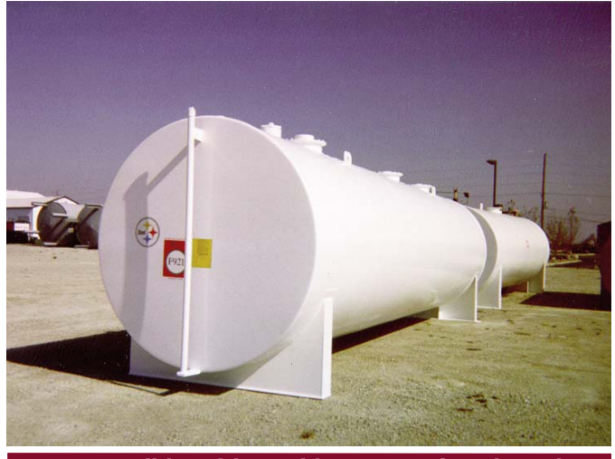
Compatible With a Wide Range of Fuels and Chemicals, Including Biodiesel and Ethanol

F921° aboveground storage tanks are manufactured with a double-wall steel design. Standard features include built-in, testable, interstitial monitoring capability and impermeable secondary containment. The F921° delivers uncompromising performance, reliability, service and economy.